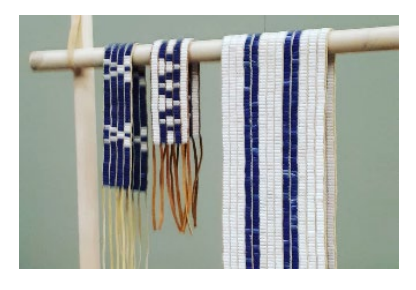
Source: Wampum Georgina Ontario by Oaktree b is licensed by CC BY-SA 4.0