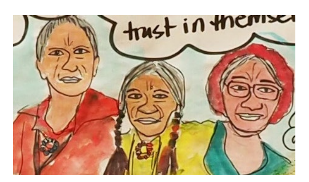
Image by Anne Gomez, 2020. Created for the Family Spirit Program of Leech Lake Band of Ojibwe as a part of their work on the Blue Cross Blue Shield Health POWER initiative.

During the evaluation co-design process with the PDG Indigenous grantees, one of the participants said "we will know if our Indigenous children are doing well by how their grandmas feel they are doing." The "Grandma Test" is used as a metaphor in the PDG Indigenous evaluation to address the impact of the PDG on Indigenous children, families, and communities. It indicates how children are able to interact with their grandmas and other Indigenous relatives. Can they tell jokes and giggle with their friends and elder relatives using their Indigenous language? Do they interact with their peers and relatives in ways that reflect their cultural values and teachings?