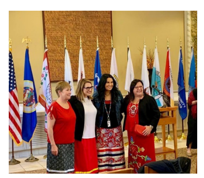
Missing and Murdered Indigenous Women Bill signing, Photo credit: https://mn.gov/indianaffairs/index.html

In 2019, a Missing and Murdered Indigenous Women Task Force was established by the Minnesota Legislature. The Task Force's recommendations were released with their final report in December 2020. The Legislature included funding in the Judiciary and Public Safety budget bill to create a Missing and Murdered Indigenous Relatives (MMIR) Office. Along with a number of other duties, this office will facilitate implementation of the recommendations outlined in the report, coordinate with other organizations and state agencies, and report on activities and outcomes with the directive of preventing and ending the targeting and exploitation of Indigenous women, children, and Two-Spirit people.