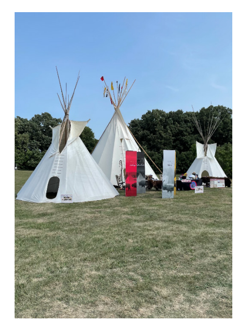
Dakota Language Symposium Lower Sioux.

In 2020-2021, MIAC distributed and oversaw $1.5 million in funding for language revitalization. The funding comes through the Arts and Cultural Heritage Fund appropriation of the Legacy Amendment, which is funded by Minnesota's state sales tax. There are three funding streams: a competitive grant, a grant for language immersion schools, and a grant specifically for Tribal Nations. To apply for the grant, organizations or Tribes propose a project that has a long-term vision to achieve language proficiency and uses short-term steps to achieve the vision. Grantees also develop an evaluation component so MIAC can learn what is successful and sustainable for Dakota and Ojibwe language revitalization programs. These programs operate across the state and serve a diverse group of American Indian communities.