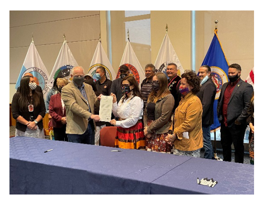
Government to Government bill signing.

In the 2021 special legislative session, the Minnesota Legislature passed Statute 10.65, the Government-to-Government Relationship between the state of Minnesota and Tribal Governments. This formally recognizes the status of 11 federally recognized Indian Tribes as sovereign nations and outlines the mutually beneficial relationship between the Tribes and the State of Minnesota. Furthermore, the new law requires that state agencies consult annually with each of the Minnesota Tribal governments on matters that may impact Tribes and American Indian people. Having the Tribal consultation process codified demonstrates significant improvement in how the state interacts with Tribes on a government-to-government basis.