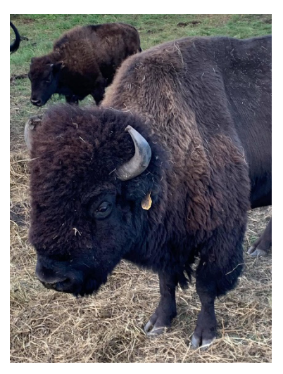
Prairie Island buffalo heard.