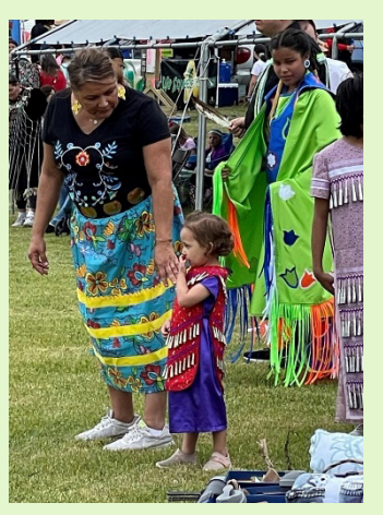
Vermillion Powwow.

As a state entity, MIAC Cultural Resources Department works on similar projects as THPOs on public and private land and waterways in Minnesota. With MIAC's work falling under state laws and THPOs' work falling under federal laws, in the past THPOs have often been left out of critical conversations in Minnesota. Even if there is not a formal role for THPOs within state legislation, THPOs continue to provide a wealth of knowledge and are representing Minnesota Tribes in this work. Over the past year, MIAC has worked with a number of Tribal leaders to include THPOs in their work. THPOs provide MIAC staff feedback